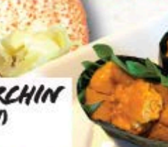
SEA URCHIN & BEEF うにく M.P.