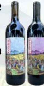
HONDA-YA WINE 2022(Blue) 2020(Pink)