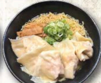
WONTON $16.95 ワンタン麺 SOY SAUCE FLAVOR TOPPED W/ BAMBOO SHOOT, GREEN ONION & CHICKEN WONTON