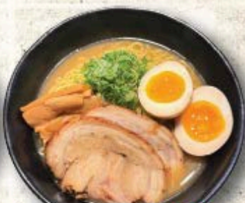
MISO $14.95 味噌 MISO FLAVOR TOPPED W/ BAMBOO SHOOT, GREEN ONION & ROASTED PORK SLICE 2PCS, FLAVOR BOILED EGG