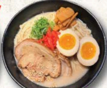
TONKOTSU $15.95 とんこつ THICK FLAVORED PORK BROTH TOPPED W/ BAMBOO SHOOT, GREEN ONION, ROASTED PORK SLICE 2PCS, PICKLED GINGER & FLAVOR BOILED EGG