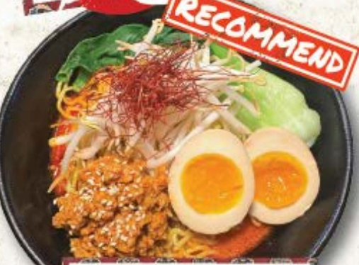
DAN DAN $17.95 担々麺 SPICY SOY SAUCE FLAVOR TOPPED W/ GROUND CHICKEN, BOK CHOY, BEAN SPROUT & FLAVOR BOILED EGG