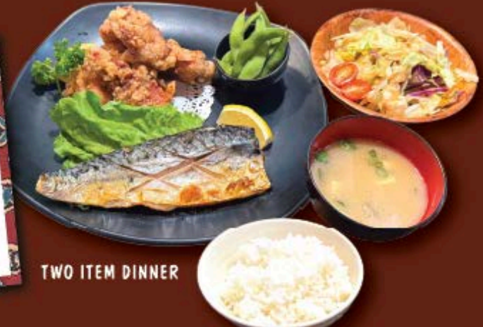
TWO ITEM DINNER