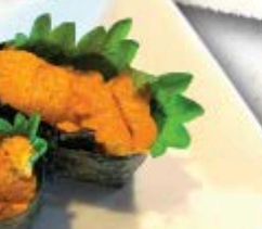
SEA URCHIN & BEEF うにく M.P.