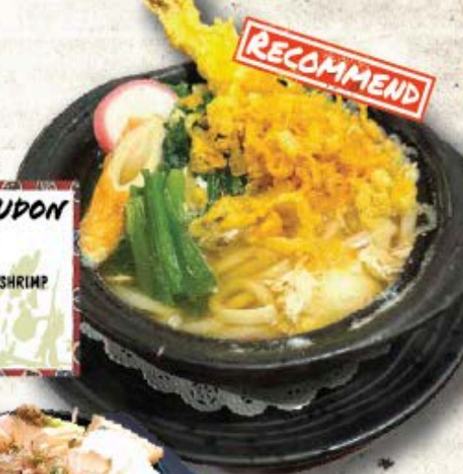
NABEYAKI UDON (UDON ONLY) 鍋焼きうどん HOT NOODLE SOUP W/ SHRIMP TEMPURA, CHICKEN, EGG & VEGETABLE $15.95