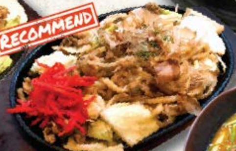
OSAKA STYLE YAKIUDON 大阪風焼きうどん PAN FRIED UDON W/ PORK, BEAN SPROUT, CABBAGE, DRIED SHAVED BONITO & WORCESTER SAUCE $12.95