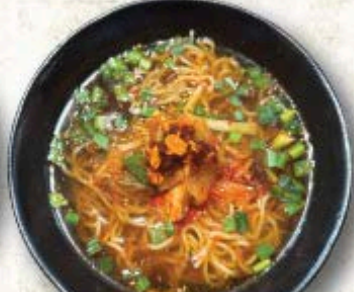
NANBAN $17.95 南蛮 SPICY SOY SAUCE FLAVOR TOPPED W/ GREEN ONION AND NORA