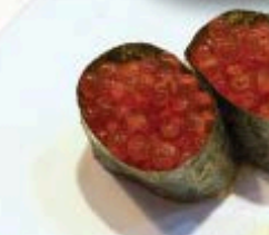
SEA URCHIN & BEEF うにく M.P.