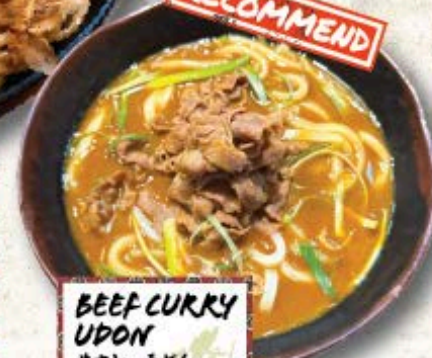
BEEF CURRY UDON 牛カレーうどん $14.95