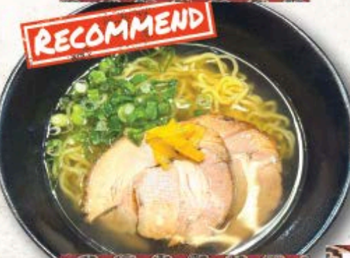
YUZU SHIO $14.95 ゆず塩 YUZU SHIO FLAVOR TOPPED W/ BAMBOO SHOOT, GREEN ONION AND ROASTED PORK SLICE 2PCS