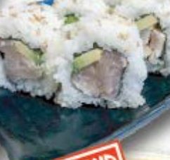
PHILADELPHIA フィラデルフィア $10.95