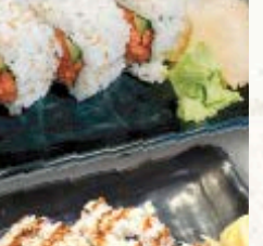
ALBACORE & AVOCADO アバコアボカド $6.50