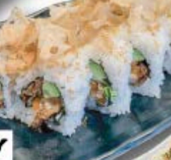
SEA URCHIN & BEEF うにくにぎり M.P.