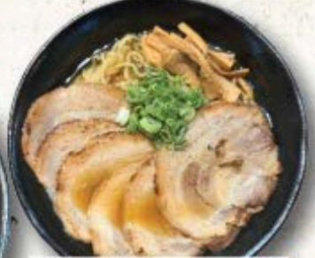
CHA-SHU $18.95 チャーシュー SOY SAUCE FLAVOR TOPPED W/ BAMBOO SHOOT, GREEN ONION & ROASTED PORK SLICE 2PCS