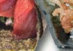
CRUNCHY クランチ $6.95