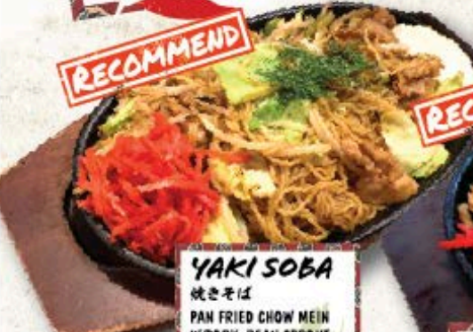
YAKI SOBA 焼きそば PAN FRIED CHOW MEIN W/ PORK, BEAN SPROUT & CABBAGE $12.95