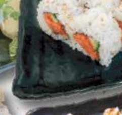
SPIDER スパイダー $10.50