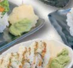
AVOCADO アボカド $6.50