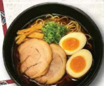
SHOYU $14.95 醤油 SOY SAUCE FLAVOR TOPPED W/ BAMBOO SHOOT, GREEN ONION & ROASTED PORK SLICE 2PCS, FLAVOR BOILED EGG